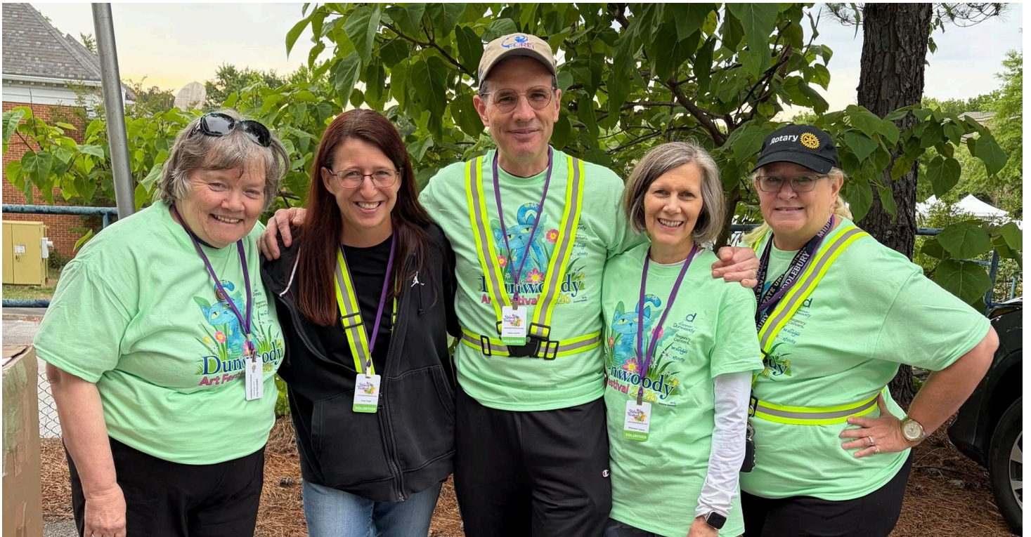
From the Dunwoody Arts Festival Staff ...

We want to extend our heartfelt thanks to everyone who supported the Dunwoody Art Festival! From setup to closing, your hard work, flexibility, and dedication helped make the festival a success. Events like this truly take a team effort, and we are incredibly grateful for each person who gave their time and energy to serve our artists and guests.